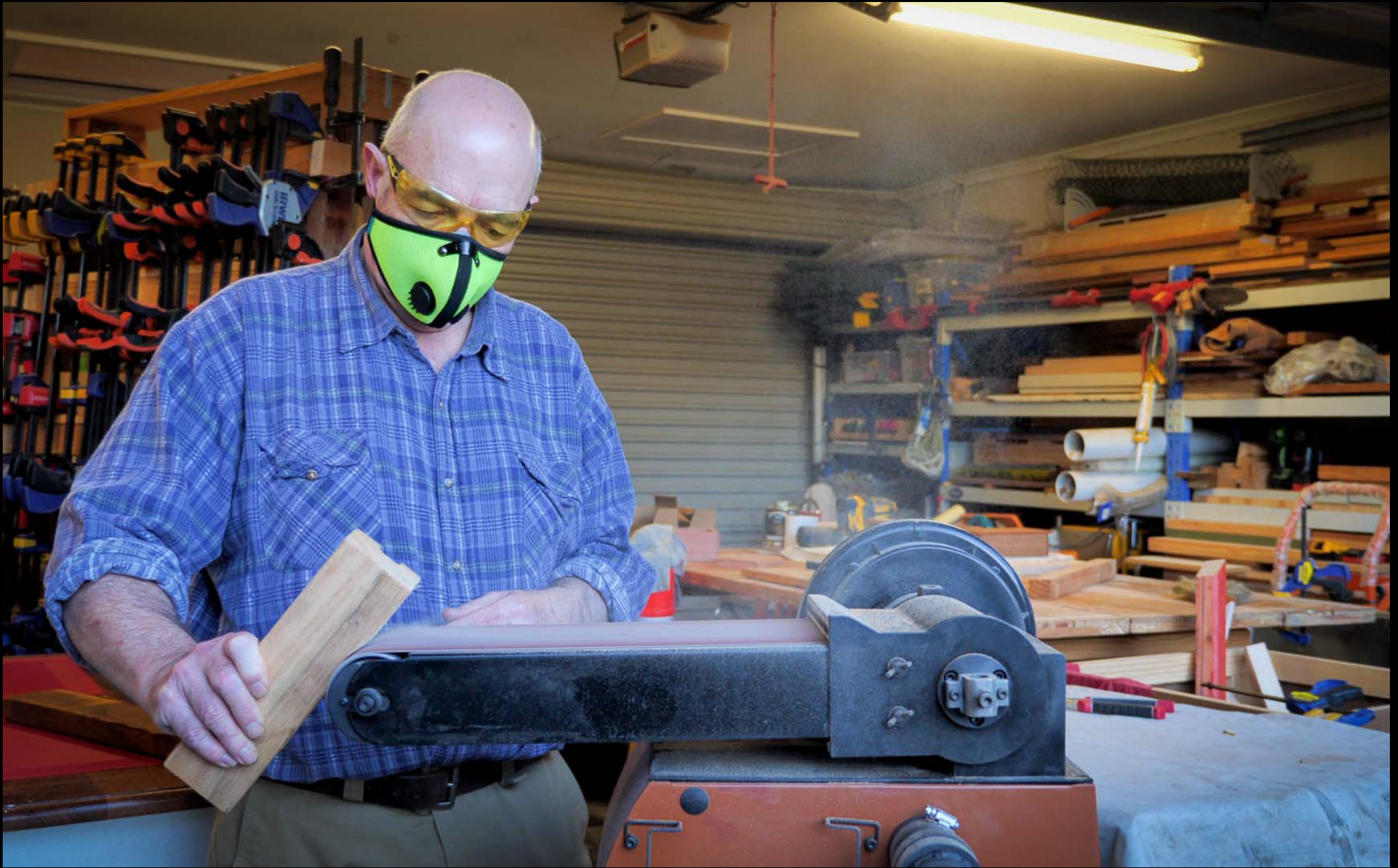
Ladder closed to keep sawing and sanding dust out of the attic