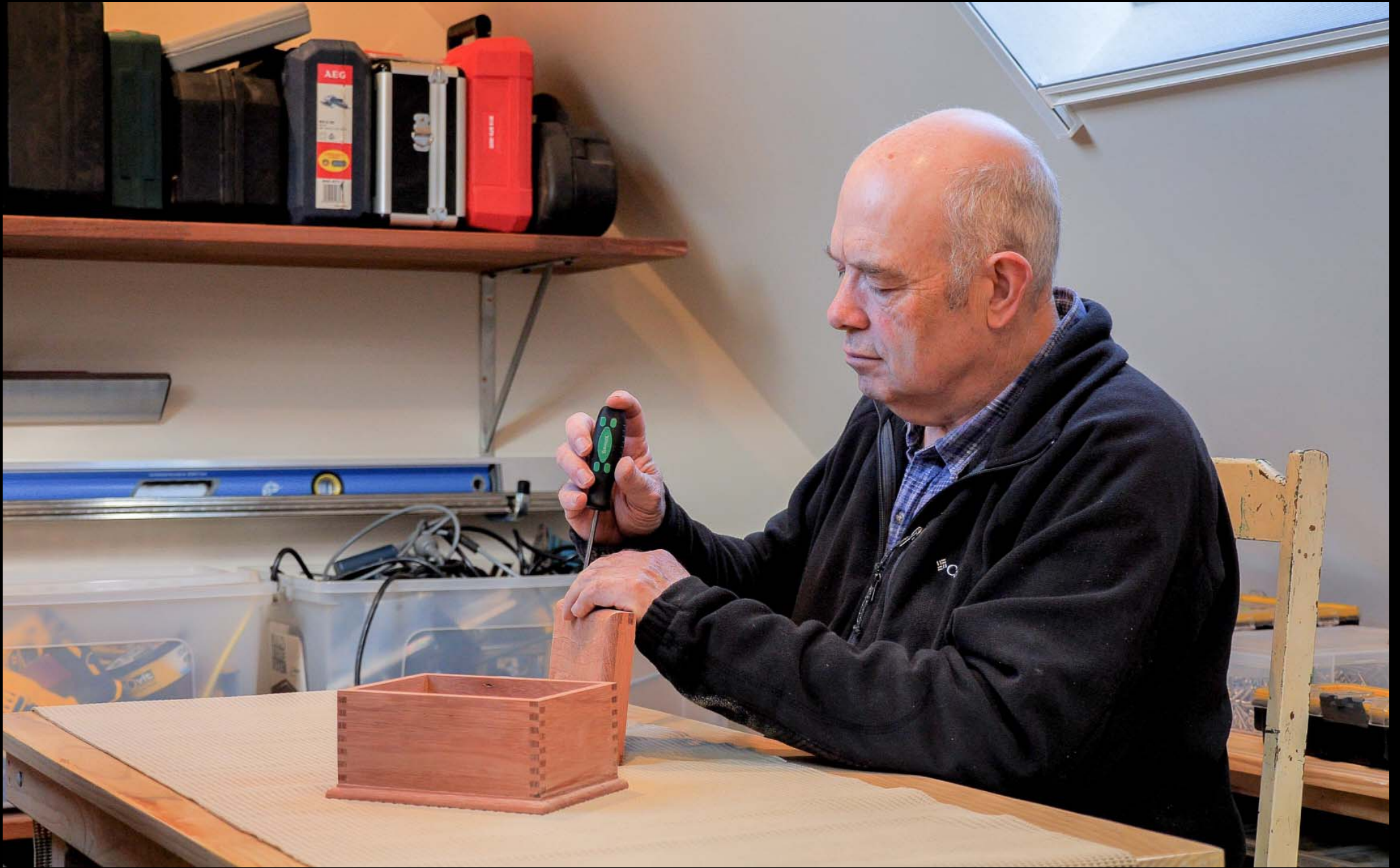
Assembly and finishing upstairs