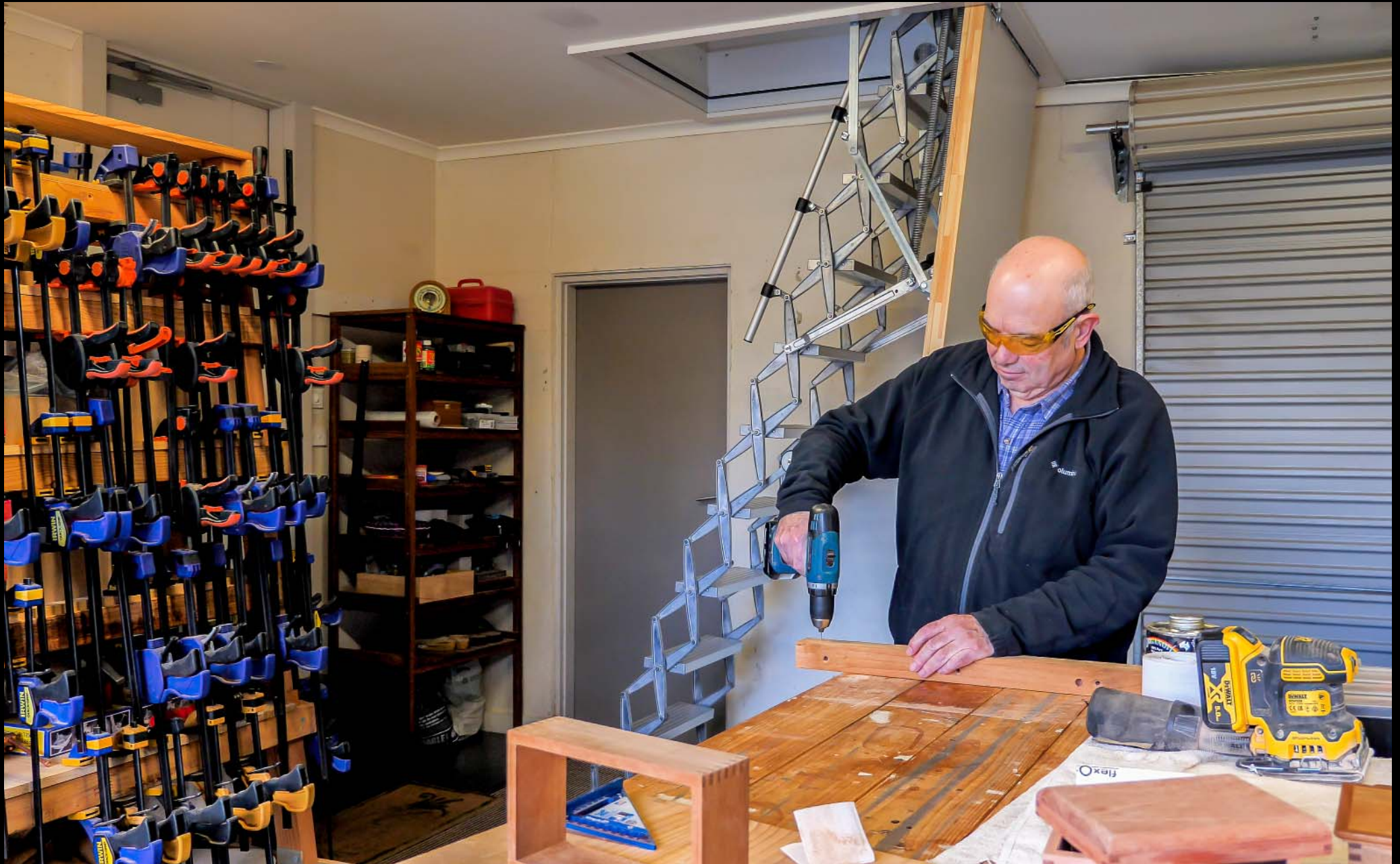
Small tools come downstairs for use