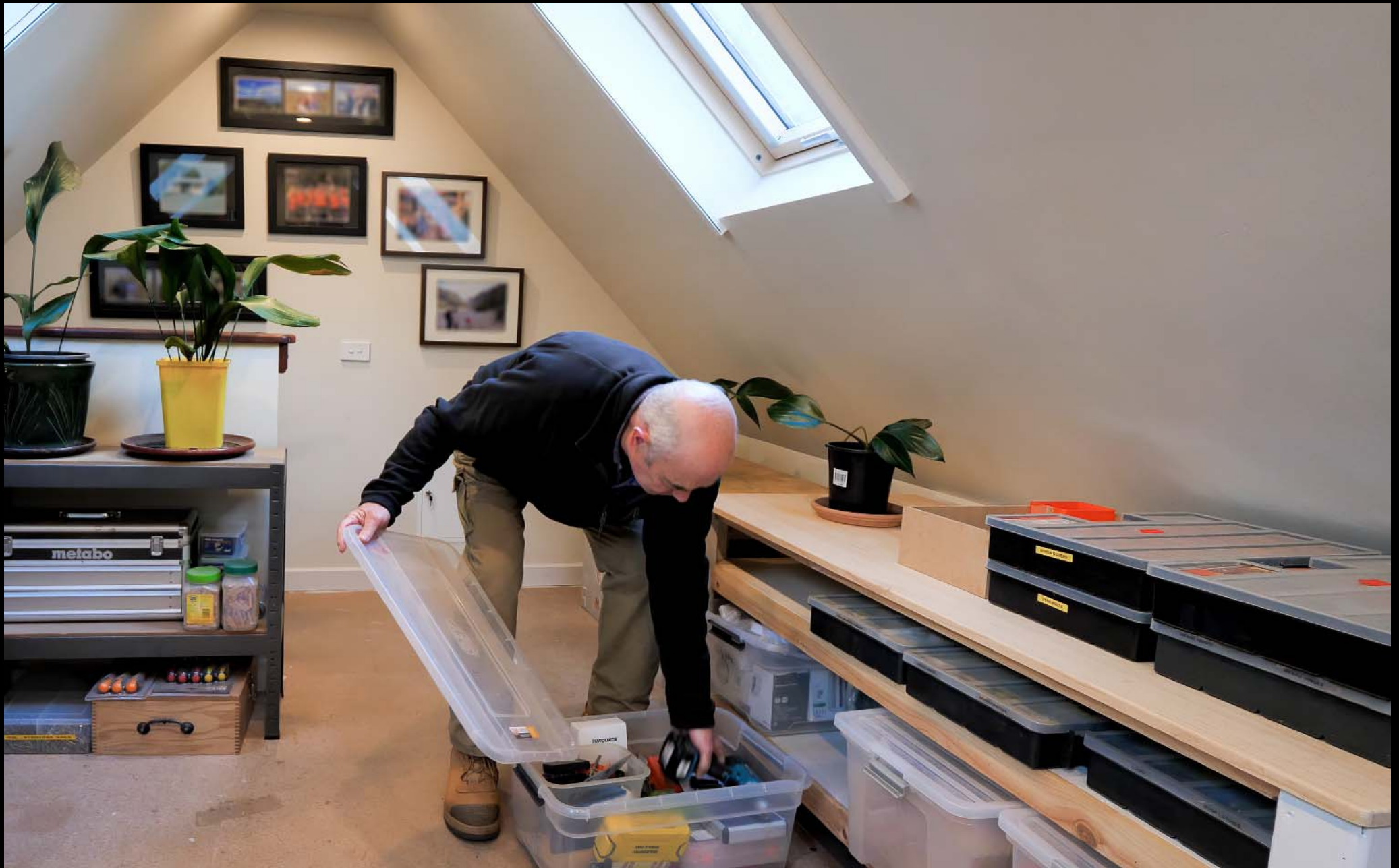
Smaller tools and parts stored upstairs